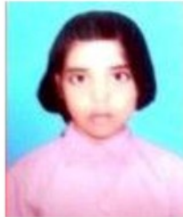
98% Komal Nursury, Saharsa (Bihar)