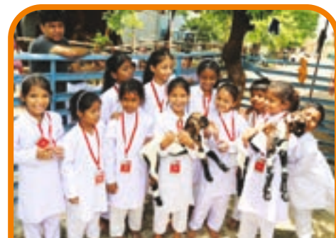
Profound love for animals