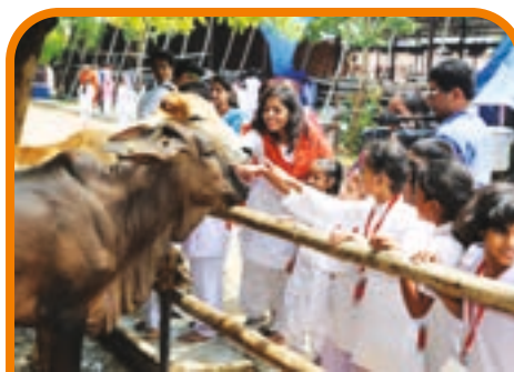
Visit to Gaushala