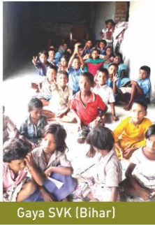
Gaya SVK (Bihar)