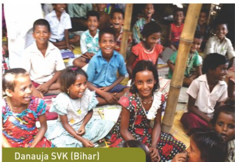
Danauja SVK (Bihar)