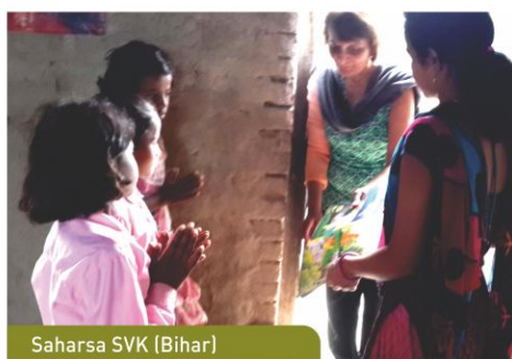
Saharsa SVK (Bihar)