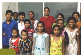
Paschim vihar SVK (Delhi)