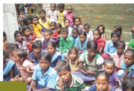
Parsauni & Gaya SVK (Bihar)