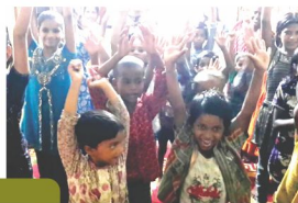
Rithala SVK (Delhi)