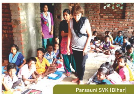
Parsauni SVK (Bihar)